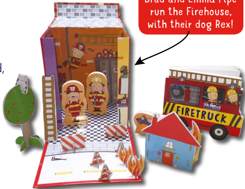
Brad and Emma Pipe run the Firehouse, with their dog Rex!

Each beautifully decorated house contains more surprises: press out pieces that fit together to form 3D furniture; three wooden characters to play with; and a board book with brilliant illustrations.