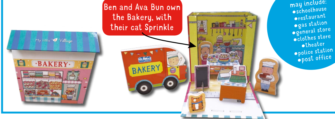
Ben and Ava Bun own the Bakery, with their cat Sprinkle

Each house and characters in the My Little Village series is unique – collect them all to start your own village community where everyone helps their neighbors!